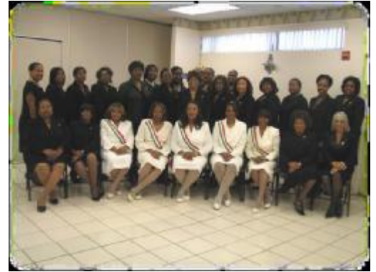
New Member Installation Photo December 5, 2009