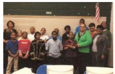
Newnan chapter members and elementary school students during one of the art sessions

of the 7 weeks, a mural was sketched and painted by the students.