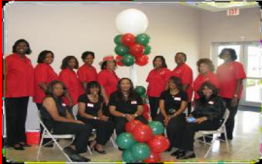
New Members Project