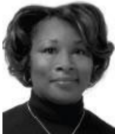
National Program Manager Colgate's Bright Smiles, Bright Futures Colgate-Palmolive Company